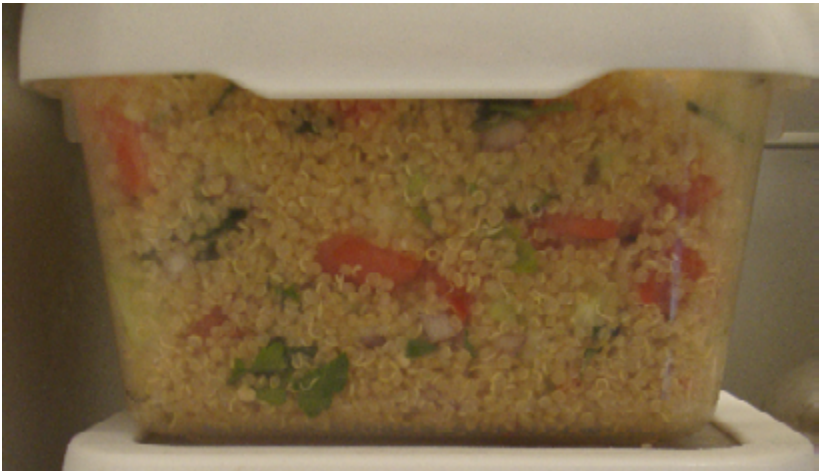
Freezer safe container of tabouli quinoa